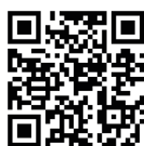
Lehtosen Konepaja Oy