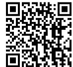
LEKO Fans Oy